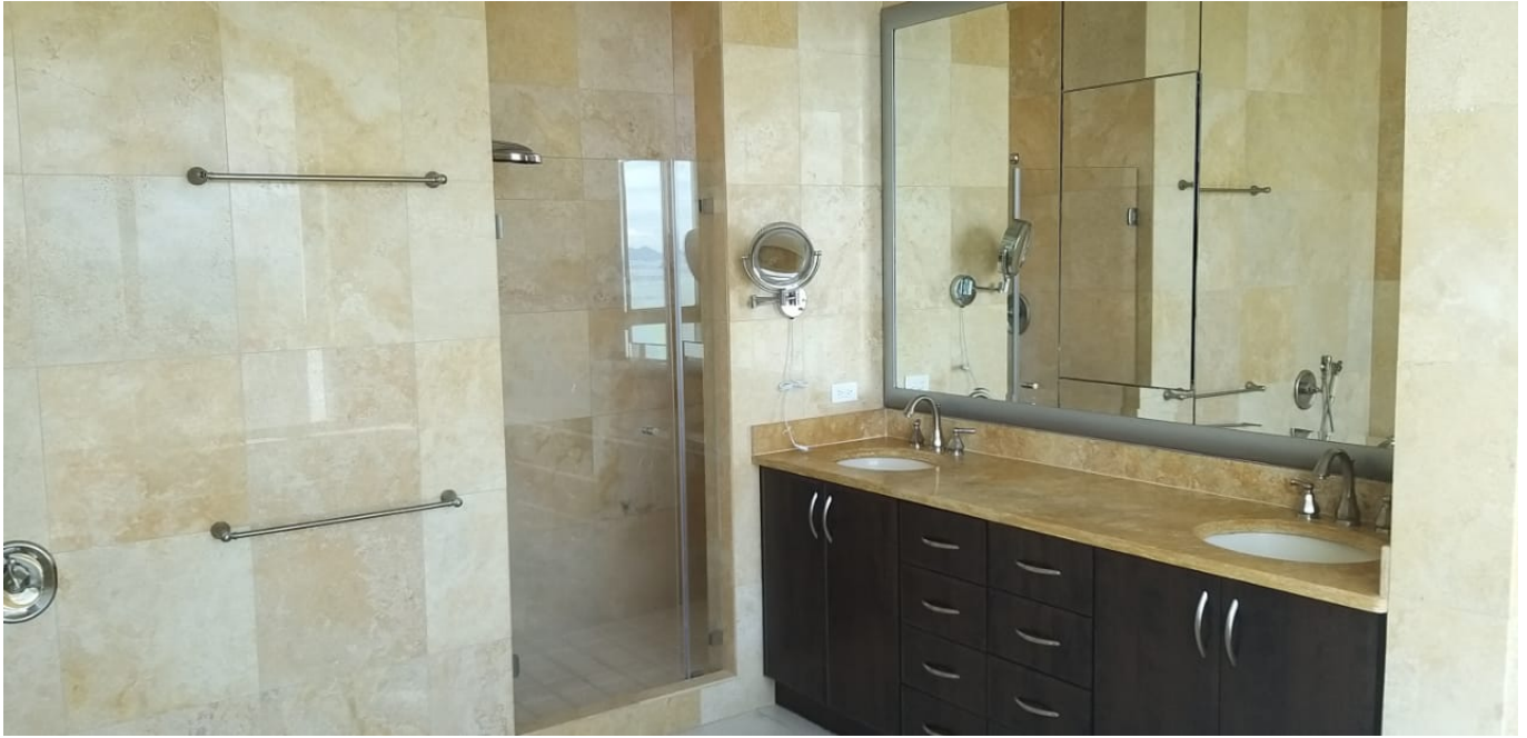
PENTHOUSES TÍPICOS DE 415 mts2 Nivel 41 a 52