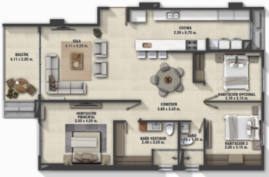
Apartamento de 121.99 m 2