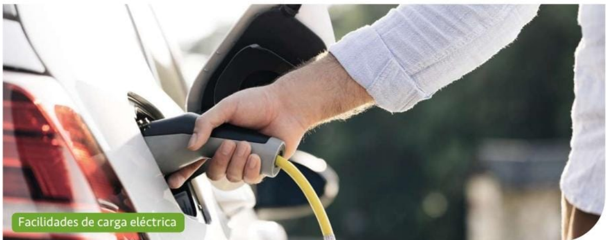
Facilidades de carga eléctrica