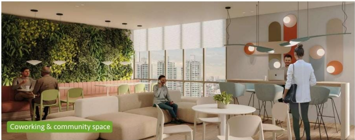
Coworking & community space